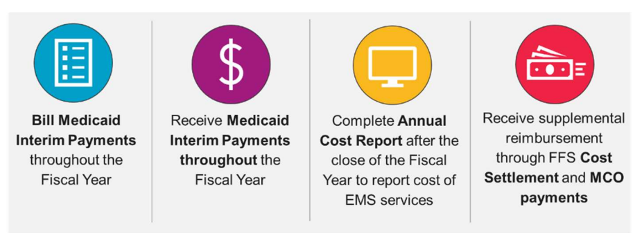
Figure 1. Typical ASPP Process